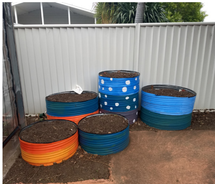
Garden beds made from leftover metal sleeves