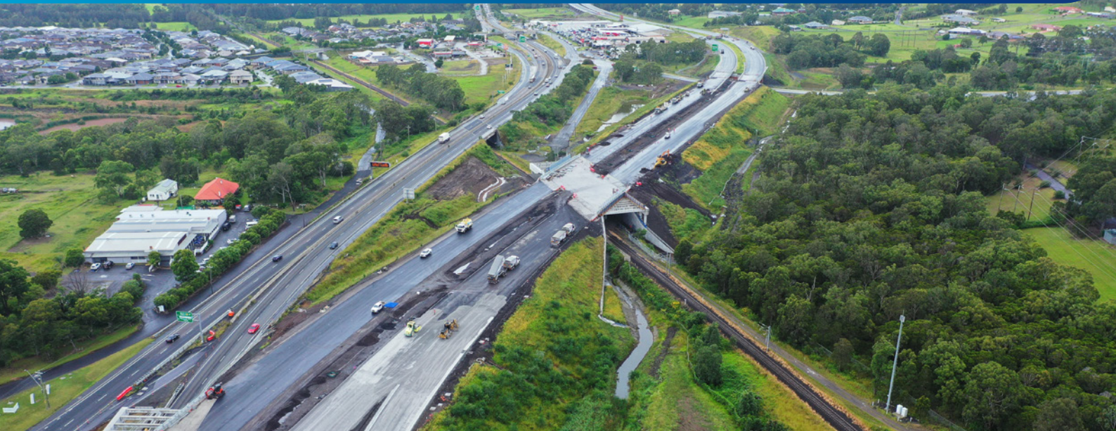
New motorway being built on the right looking towards Yallah