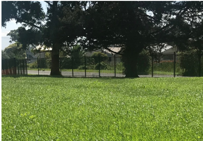
Albion Park Public School playground after work was finished in January 2021

A natural drain was built and grassed, making the infant's playground safer and more accessible.